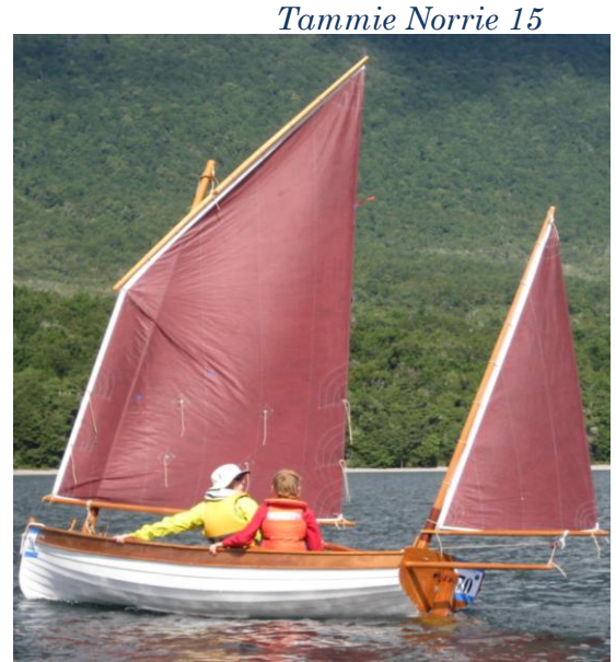
Tammie Norrie 15