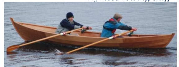
Wemyss rowing skiff